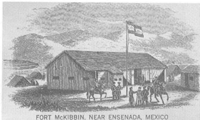
J. M. Reid, "The Ensenada," The National Magazine

On repeated sallies in the following days, the filibusters routed Melendres and finally broke the siege on December 14. According to their estimates, in the final battles they killed twenty Mexicans and wounded twenty more, while only one filibuster was wounded. Without resources in the sparsely populated Frontier, Negrete and Melendres were unable to raise additional troops and Walker was no longer attacked at Ensenada.